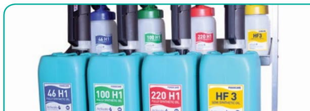
Storage after System8®

The site stored 20 products from 5 different manufacturers, with no methodical storage system. A number of these products stored were not NSF registered. A non foodgrade product had been found on a retailers food packaging which had then been found by the consumer, hence the need to move to all foodgrade lubricants.